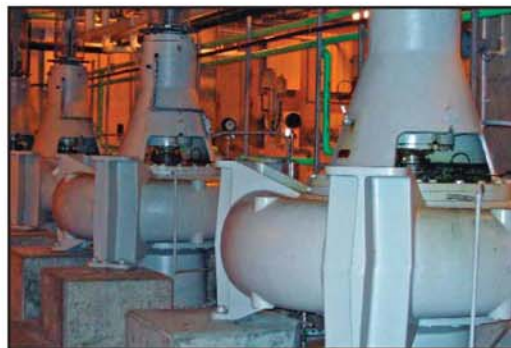
Figure 1: Split seals are being used in wastewater systems ranging from raw water intake, remote lift stations, and many other applications.

Packing leakage typically runs along the shaft toward the bearings. The leakage often migrates across the bearing seal and enters the bearing housing. The oil or grease becomes contaminated, drastically reducing bearing life. Water contamination of bearing lubrication systems has a large negative impact on bearing fatigue life and is one of the major