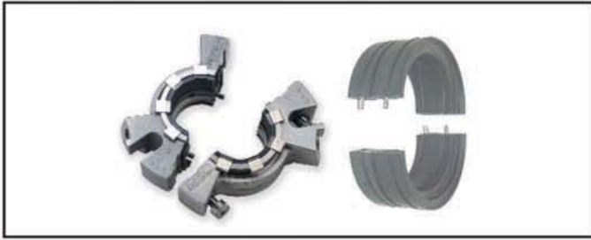
Figure 3: When combined with a split centrifugal force device and used as a sealing system, split seal reliability offers the most cost-effective sealing system for large pumps.

during loading. As a result, users are now obtaining repeatable and reliable performance in thousands of installations. Older designs could easily flex and distort causing less reliable operation at start-up and during pressure variations.